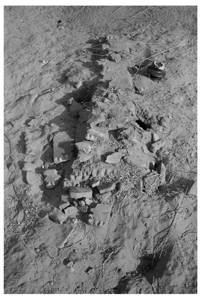
Figure 3 Gauri Gill, Untitled (4). Notes from the Desert: Traces. 1999-ongoing. Archival pigment print, 58 \times 86 inches.