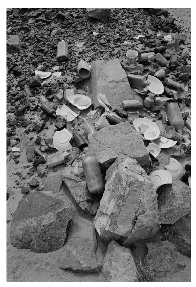
Figure 2 Gauri Gill, Untitled (5). Notes from the Desert: Traces. 1999–ongoing. Archival pigment print, 58 \times 86 inches.

Notes from the Desert (1999–) (Figures 2–4) is a series of photographs of unmarked and marked graves in the desert from the archive of images by Delhi-based photographer Gauri Gill. Recalling the Adornian dialectic, we encounter places of burial and revival, sites of accumulation of objects and memories. These handmade graves were created for and by people from the Muslim and Hindu communities, peasants, nomads and other inhabitants of remote villages in Western Rajasthan with relatively few economic resources. Gill's work seems significant not only because it contradicts the nationalist politics of today's India, but also because the graves, which exist above the ground, have been created with materials found in nature. They include hand-inscribed gravestones and personal items, offerings brought from people's homes. Some of these items are known to have belonged to the deceased; they may tell a personal story and are available for further usage – which inscribes them back into life. Accepting transience with equanimity, nature absorbs and erases the graves, including fragments of material culture. Each site is a monumental work of art and a mini museum, an ephemeral monument not plagued by the obligation to permanence and continuity. Moving between culture and nature, these sites occupy an ambiguous space-time, a liminality between commemoration and forgetting. But unlike museum collections, they transcend their material significance into a different kind