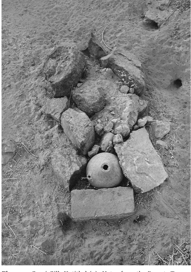
Figure 4 Gauri Gill, Untitled (3). Notes from the Desert: Traces. 1999–ongoing. Archival pigment print, 58 × 86 inches.

scenarios, activations and iterations. Due to obsolescence and the resulting cycles of emulation, migration and reinterpretation, media collections, too, appear to act against institutional limitations designed to protect the museum against any incursion by outer time that might result in change.